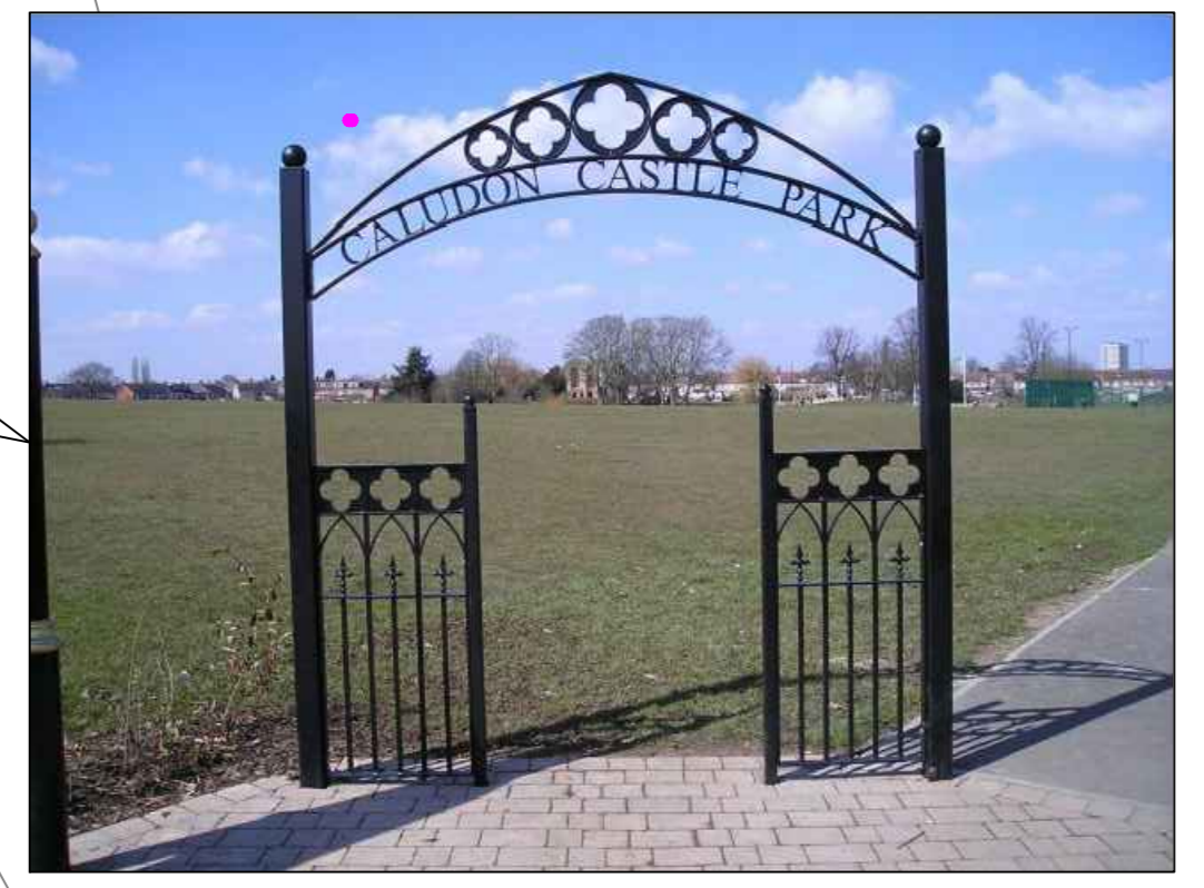
EXAMPLE OF PARK ENTRANCE ARCHWAY FEATURE

EXISTING EMERGENCY HELICOPTER LANDING AREA TO BE RELOCATED