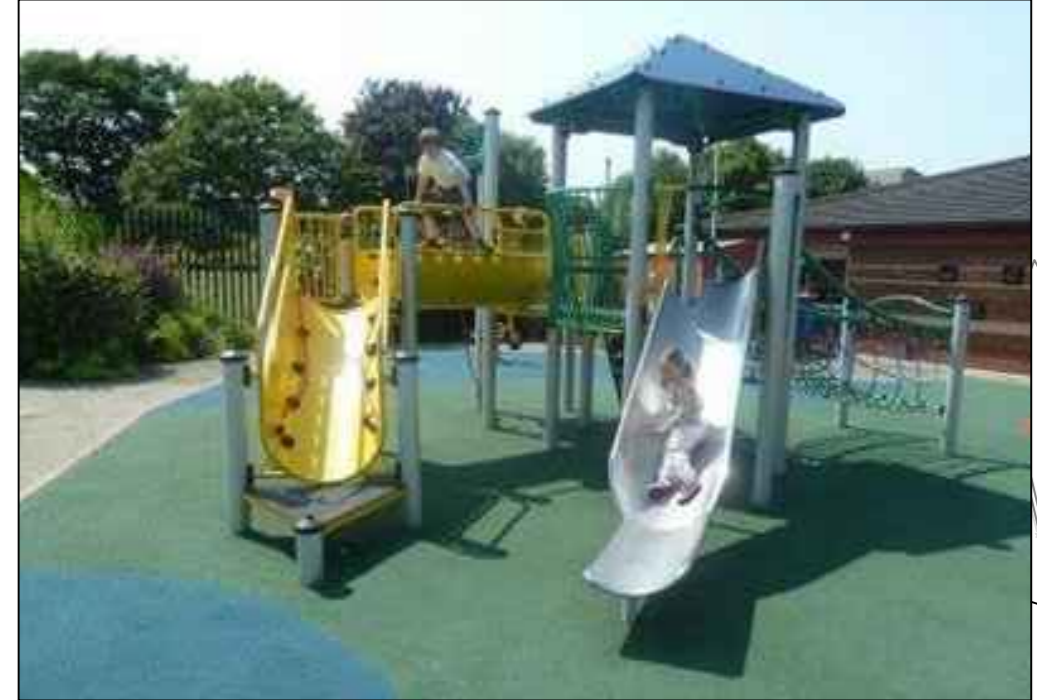
PLAY AND LEISURE NEAP