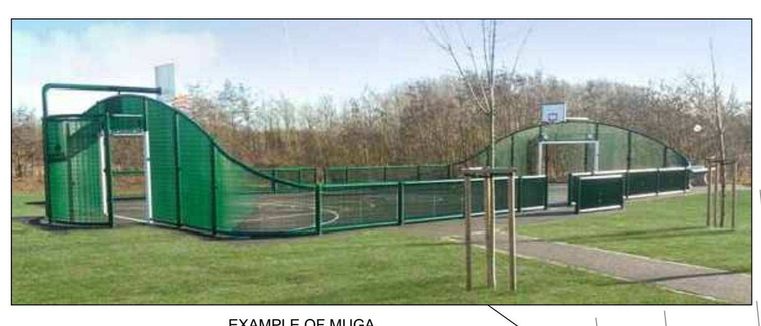
EXAMPLE OF MUGA