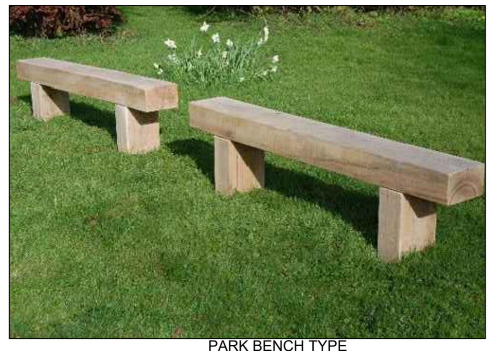
PARK BENCH TYPE

EXISTING CYCLE ROUTE TO BROADWAY (VIA CROWN HILL ROAD, MOORLAND AVENUE AND WOODLAND DRIVE)