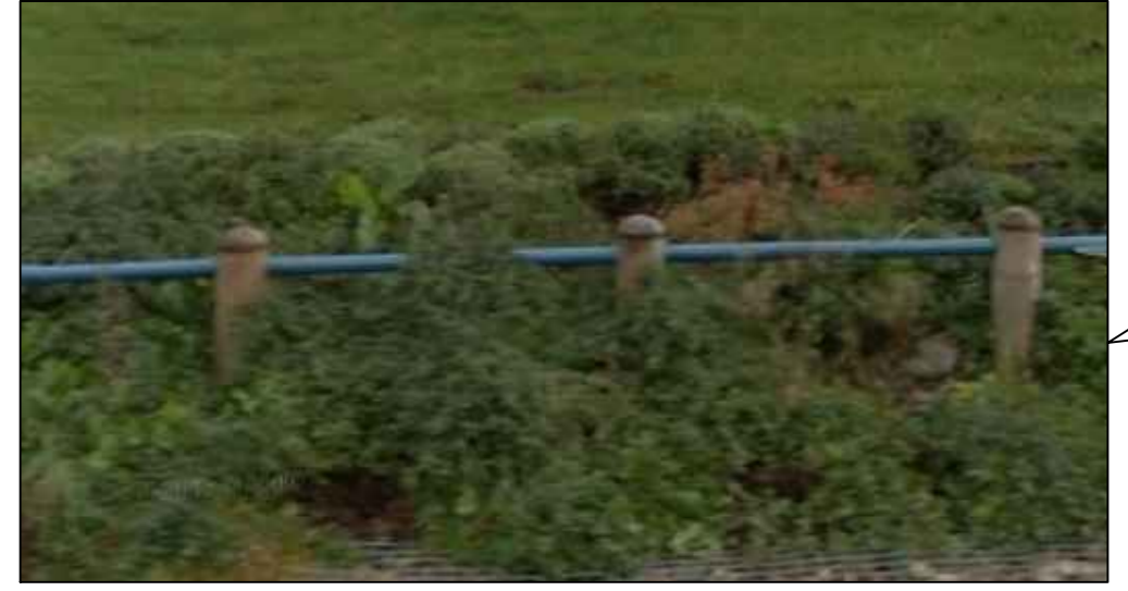
LOW TIMBER BOLLARD & RAIL

EXISTING CYCLE ROUTE TO BROADWAY (VIA CROWN HILL ROAD, MOORLAND AVENUE AND WOODLAND DRIVE)