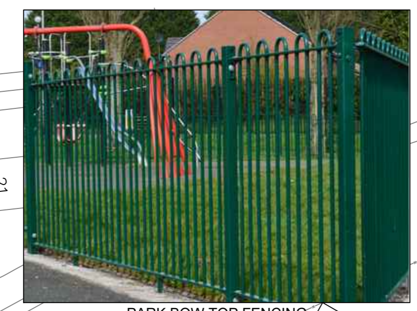
PARK BOW TOP FENCING