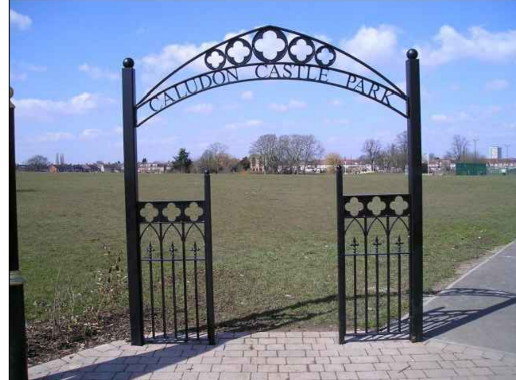
EXAMPLE OF PARK ENTRANCE ARCHWAY FEATURE